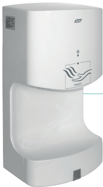
REF 8 11 707 Airwave automatic white

Automatic jet air hand dryer, anti-vandalism (IK10) with a 600 mL water collection tray and an automatic ON/OFF heating element . 2-year warranty.