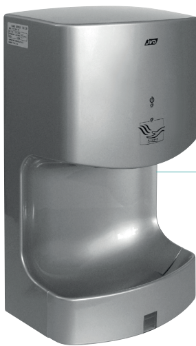
REF 8 11 684 Airwave automatic metallic grey